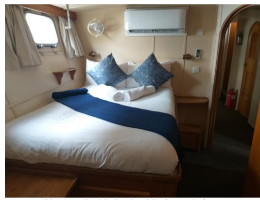
Narrow double bed cabin (en-suite)