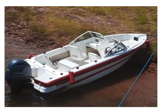
Interceptor speed boat