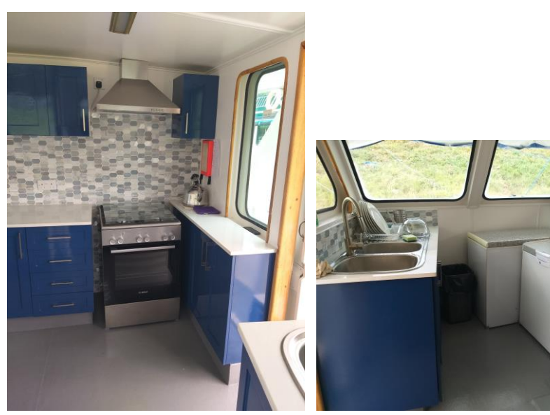
Newly refurbished kitchen