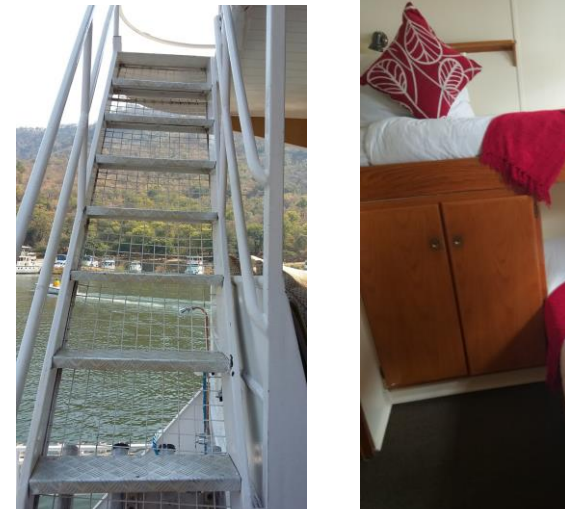
Stairs to top deck