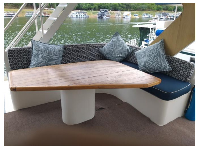
Right: Back deck seating area