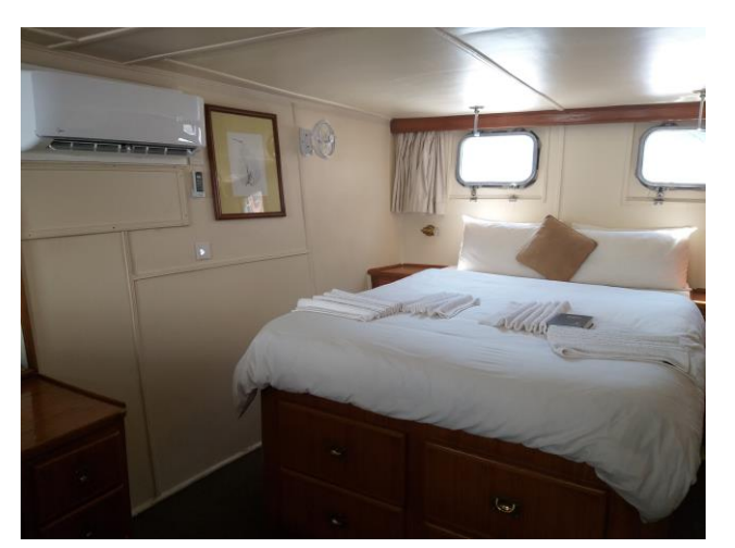
Below left one of the main cabins, Jacuzzi on right: