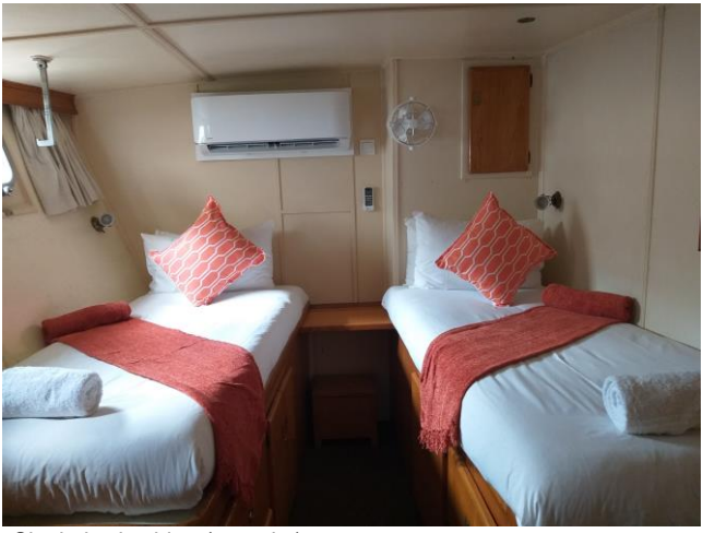
Single bed cabin (en-suite)