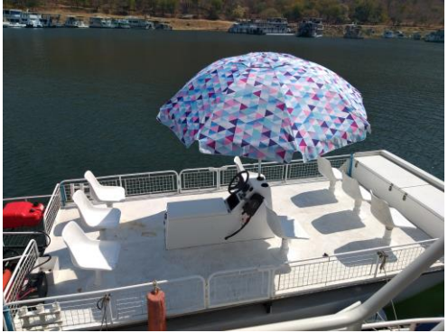
Pontoon tender boat

Distances: Harbour to Antelope / Zebra Islands 1 - 1.5 hours Harbour to Palm Bay 3 - 3.5 hours Harbour to Elephant Point 4.5 hours Harbour to Ume 5 - 6 hours