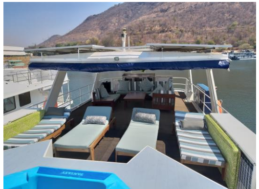
Jacuzzi & sun loungers