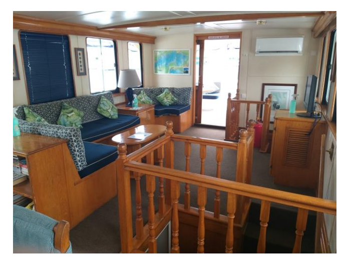
Left: interior seating area (lounge)