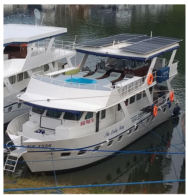
Vessel moored at Marineland Harbour, Kariba